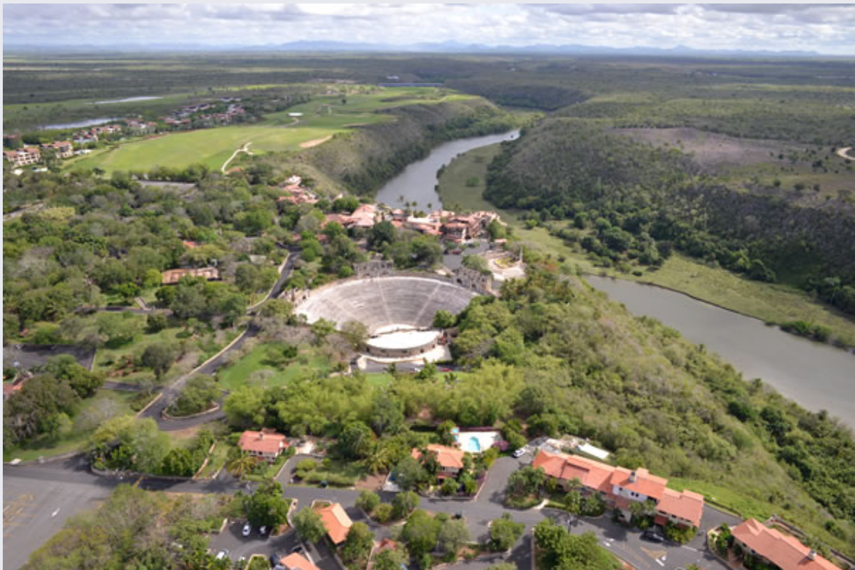
The Altos de Chavón School of Design in La Romana, Dominican Republic, will host the Davidoff International Art Residency in January 2015

In collaboration with Altos de Chavón, hailed as the country's leading institution for art and design education, the Davidoff International Art Residency will host five selected emerging to mid-career artists from around the world each year, for a period of ten weeks. One of the positions may be filled by an international curator or art writer researching Caribbean art.