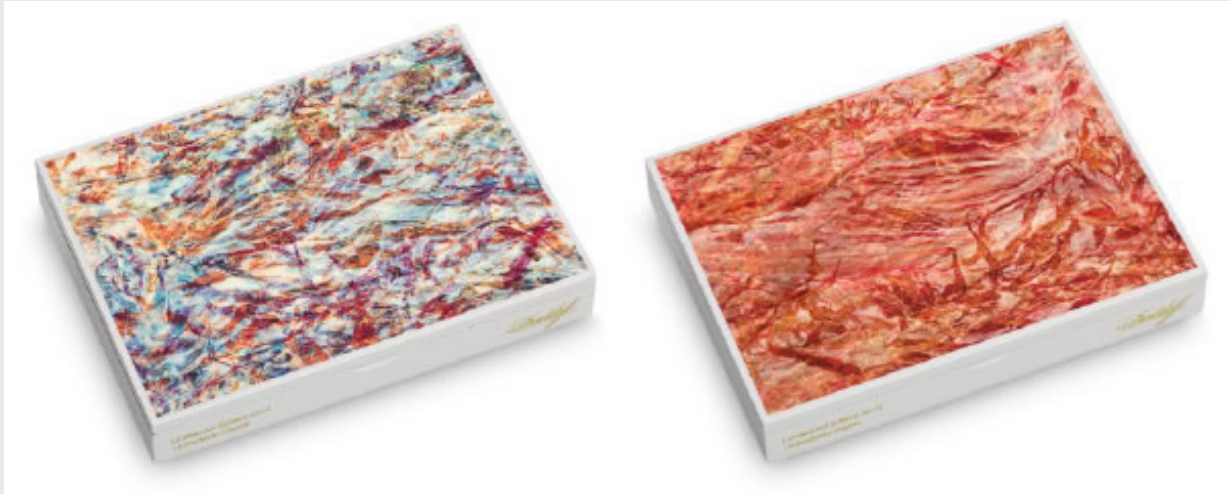
The Limited Art Edition cigar boxes featuring original artwork by Quisqueya Henríquez

Inspired by a series of visits to Dominican tobacco fields at the artist's own request, the compositions created by Henríquez for the new editions call to mind the intricate handcraft of cigar making and evoke the multiple phases involved in the tradition of cigar manufacture. The richly coloured images obtained from the layering of multiple photographs of tobacco leaves create a composition that, while abstract, hints at the source materials involved in their creation.