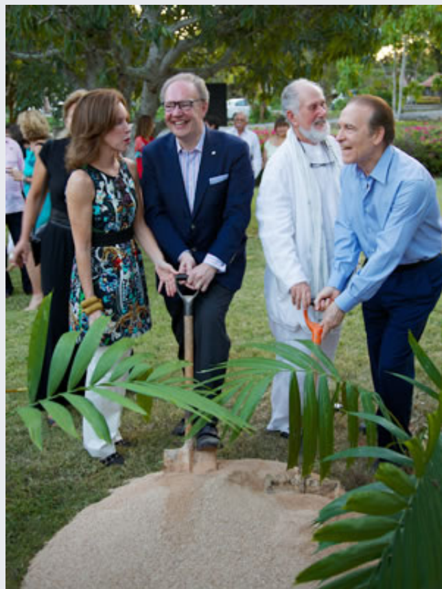
The groundbreaking ceremony for the Davidoff Art Initiative artist's studios at Altos de Chavón