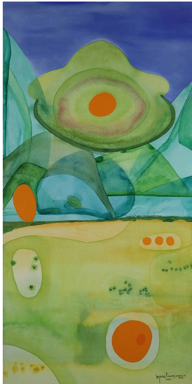
Mamey II. Serie: Tropicaribastral, 50 x 25cm, mixed media on wood, 2023