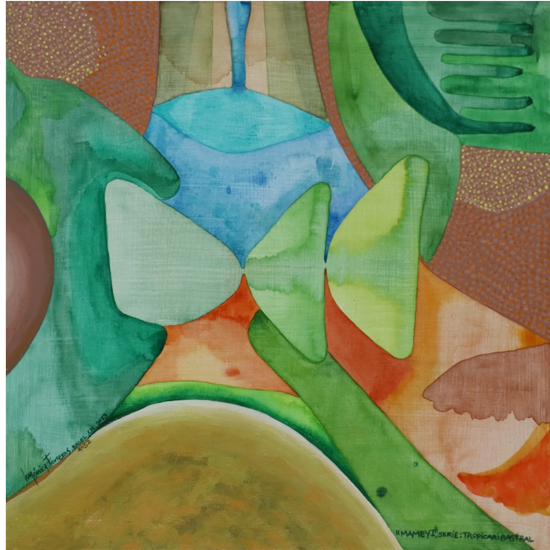
Mamey I. Serie: Tropicaribastral, 25 x 25cm, mixed media on wood, 2023