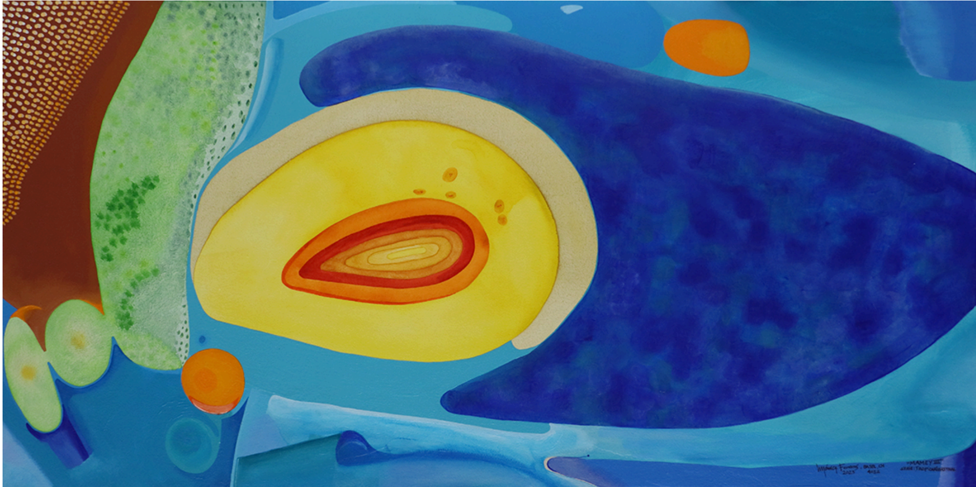
Mamey III. Serie: Tropicaribastral, 40 x 80 cm, mixed media on wood, 2023