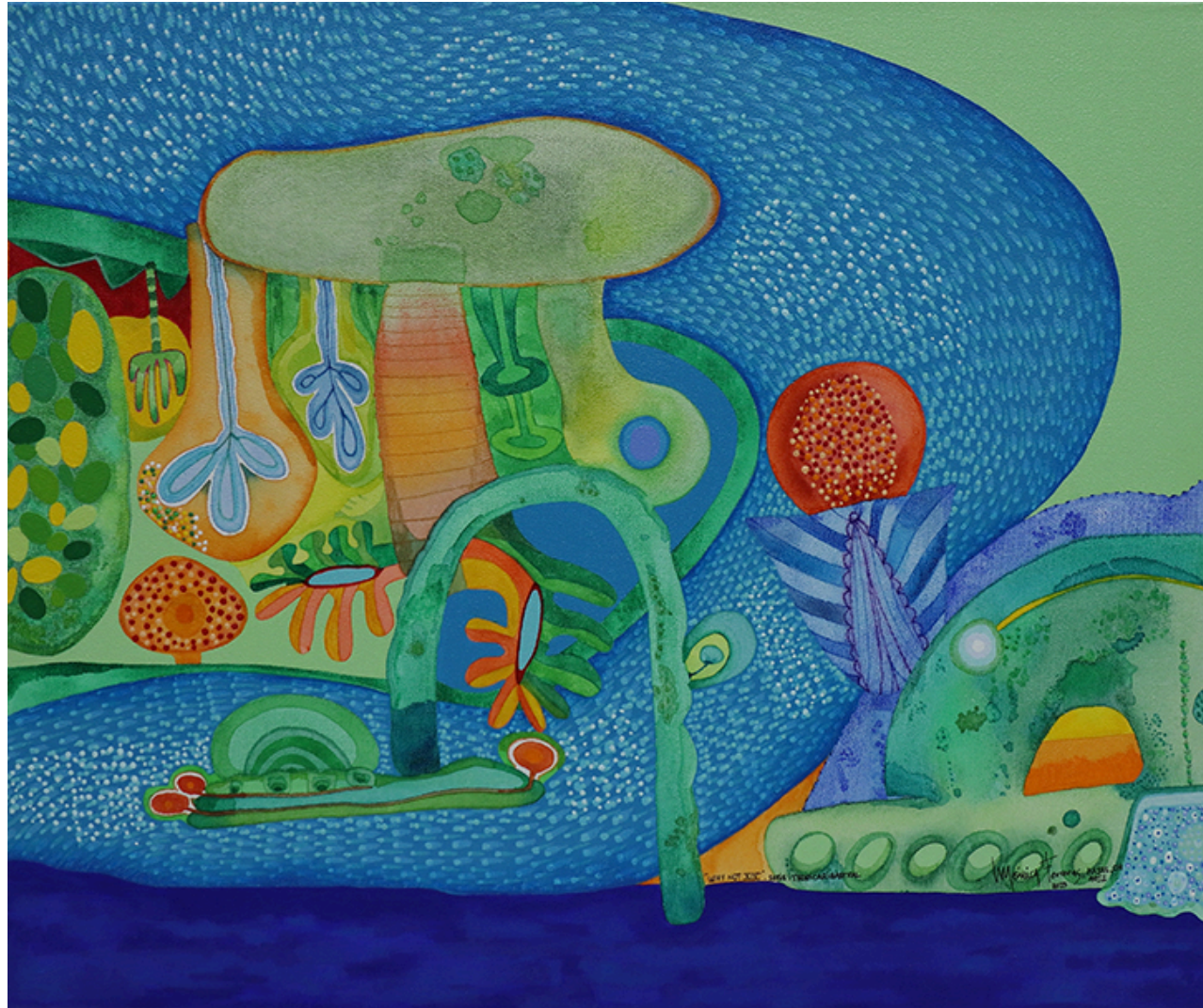
WHY NOT XIV. Serie: Tropicaribastral, 50 x 60cm, mixed media on canvas, 2023