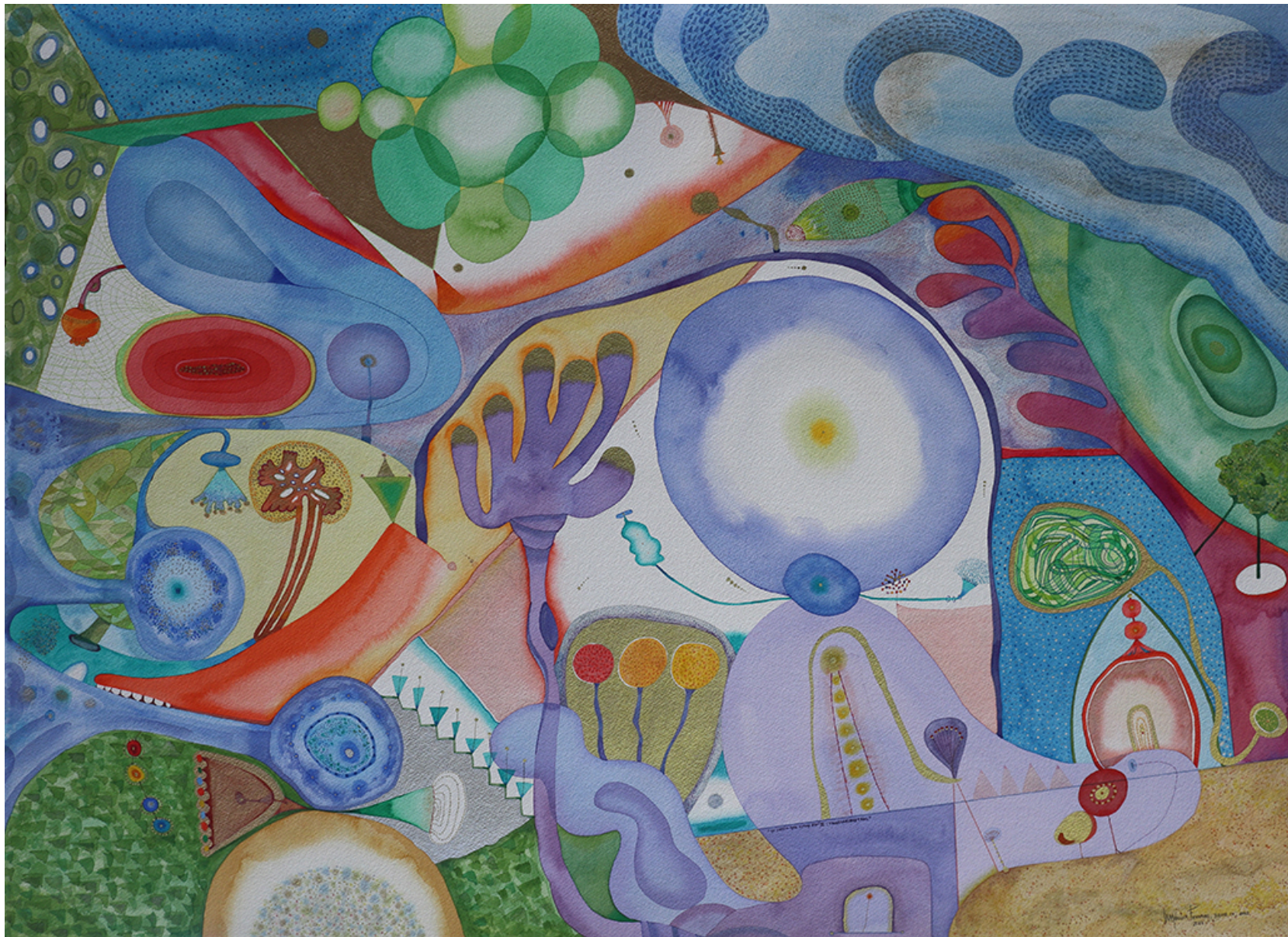
Sueño que estoy aquí II. Serie: Tropicalibastral, 75 x 105 cm, watercolor, color and graphite pencil on Arches cold pressed 640gm, 2022