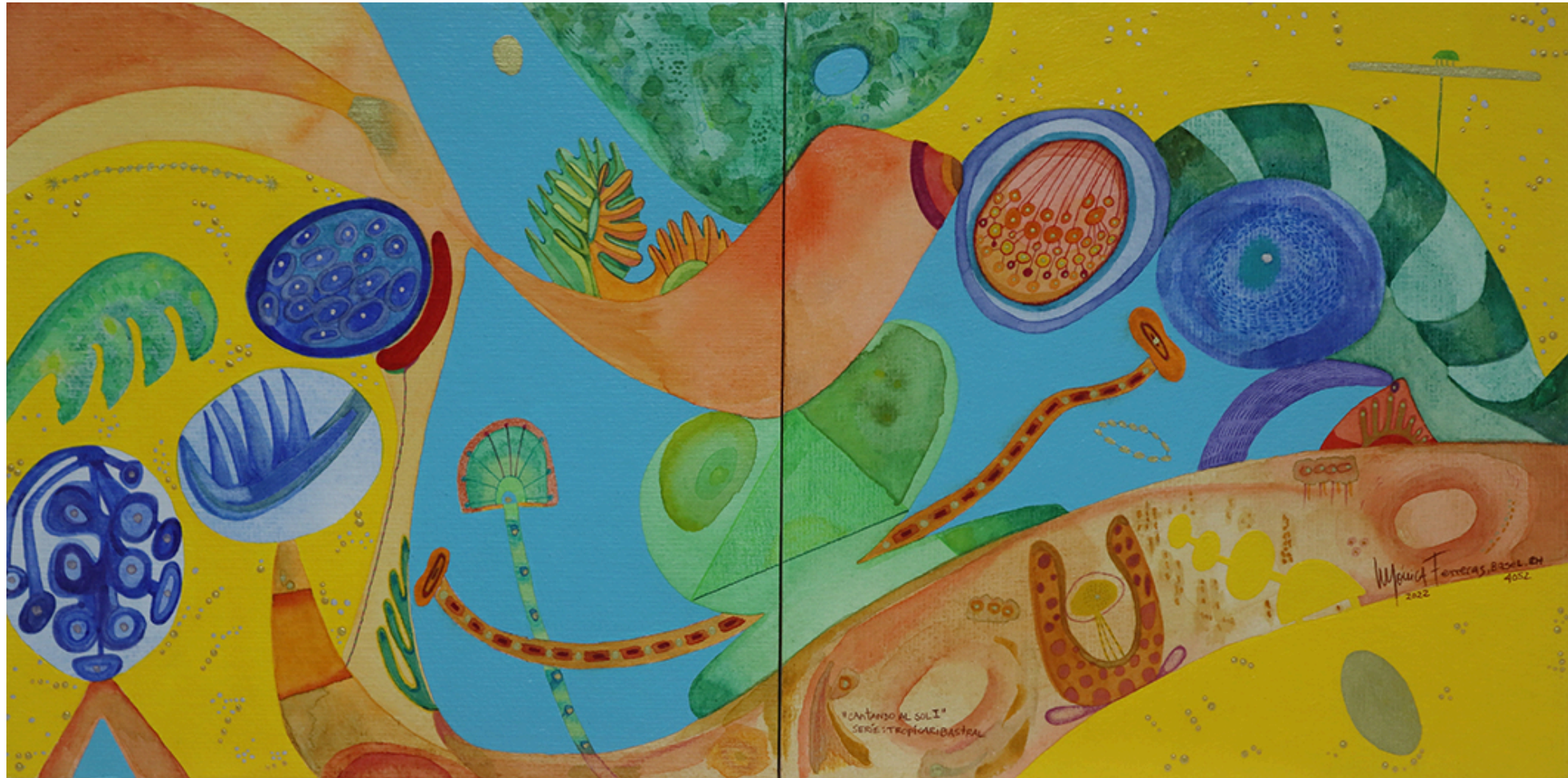
Cantando al sol I. Serie: Tropicaribastral, 25 x 50cm (dyptich), mixed media on watercolor mounted on wood, 2022