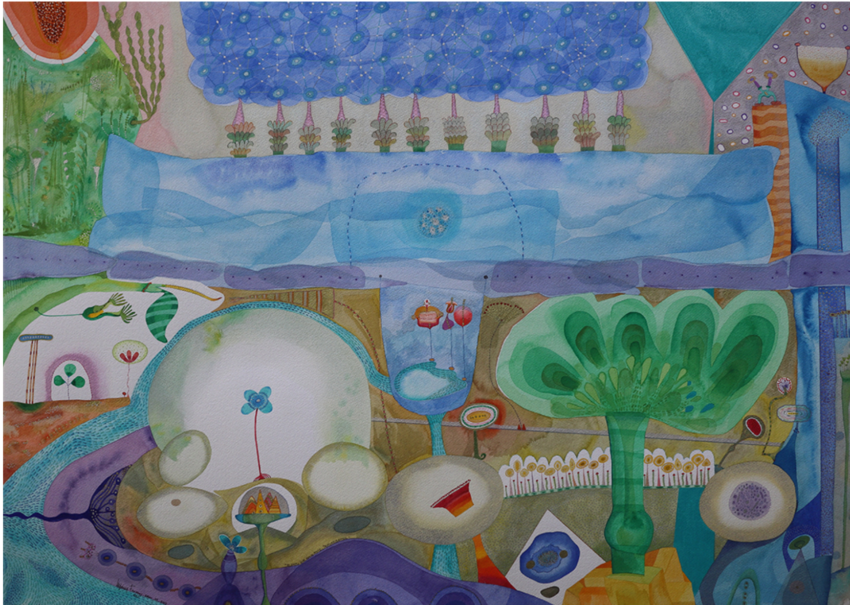
Sueño que estoy aquí I. Serie: Tropicaribastral, 75 x 105 cm, watercolor, color and graphite pencil on Arches cold pressed 640gm, 2022