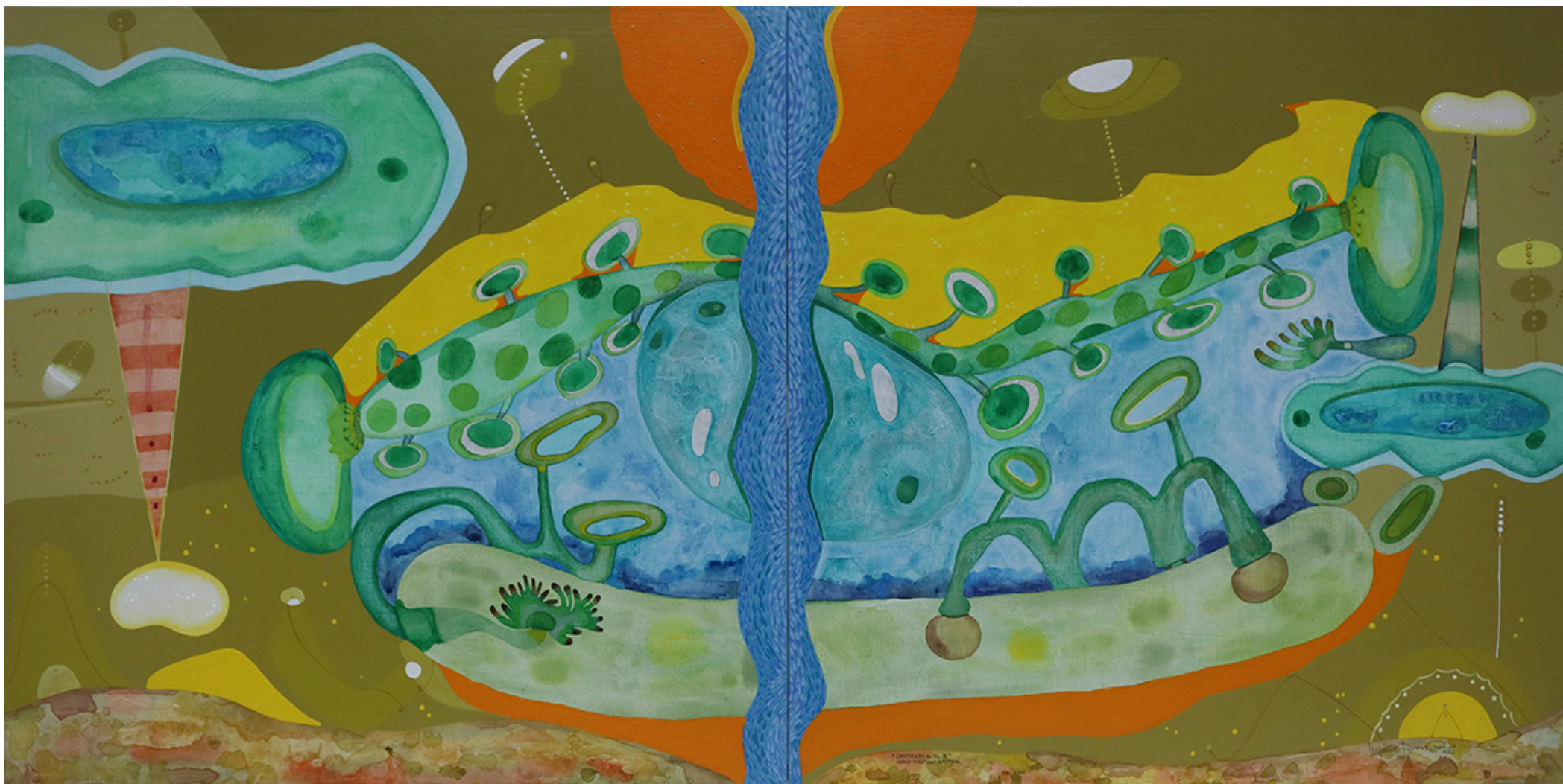
Cantando al sol I. Serie: Tropicaribastral, 50 x 100cm (dyptich), mixed media on wood, 2023