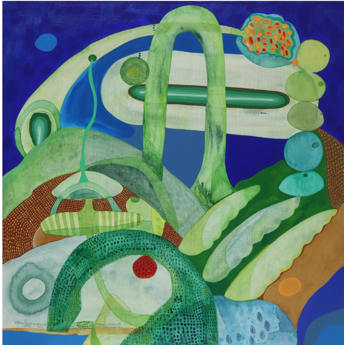
Verdes vientos. Serie: Tropicaribastral, 50 x 50cm, mixed media on wood, 2023