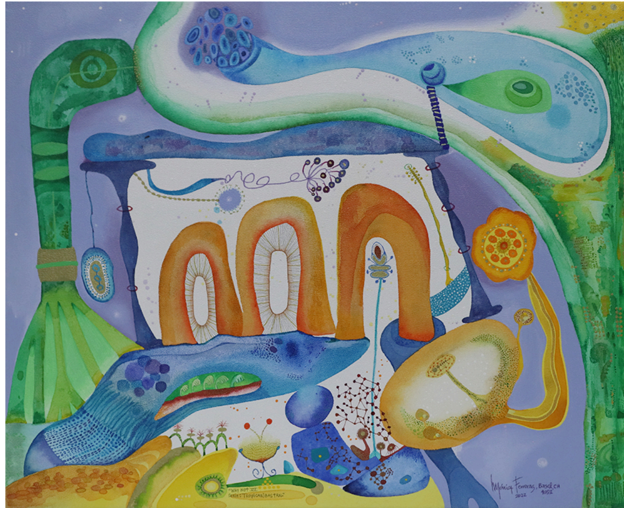
WHY NOT VII. Serie: Tropicaribastral, 50 x 60cm, mixed media on canvas, 2022